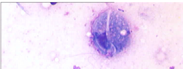
Fig1. Diff-quick-stained faecal smear showing Tritrichomonas foetus tachyzoite

The parasite targets the large bowel, colonising the ileum, caecum and colon, where it can cause lymphocytic, plasmacytic inflammation and chronic diarrhoea. Clinical signs range from asymptomatic to severe intractable diarrhoea, which can be foul-smelling and is characterised by the frequent passage of small quantities of liquid to semi-formed faeces often with blood, mucus and straining. Anal irritation may also be a feature, and in severe cases cats may develop faecal incontinence. Despite the presence of severe diarrhoea, most cats do not lose weight as it is primarily the large intestine that is affected. Indeed most cats with TF infection are not systemically ill, so if this is present it is important to look for other underlying diseases.