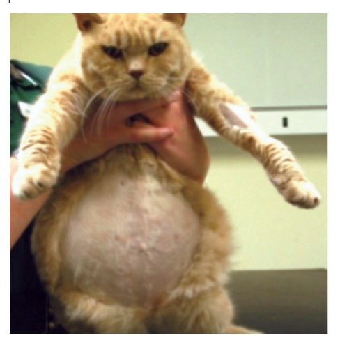
Fig. 2: British Shorthair with 'wet' FIP showing abdominal distension consistent with ascites.

• Raised \alpha 1-acid glycoprotein (>0.48 mg/ml is abnormal but levels in FIP cases are often markedly elevated at >1.5 mg/ml)